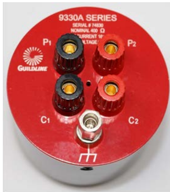
Figure 1-1 : 9330A Resistance Standard

They can be used as working standards, or highly reliable and rugged transportable transfer standards. They are extremely useful as a reference standard with a DC Resistance or Temperature Bridge; the calibration of resistance ranges of multi-function calibrators and high accuracy digital multimeters; as well as for use in more classical standards and calibration laboratory applications where high accuracy and low uncertainty values is required.