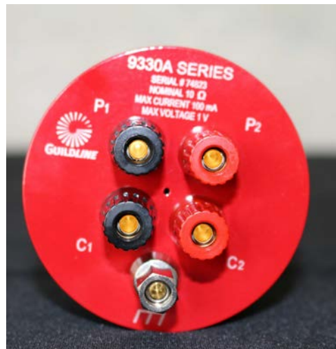
Figure 1-2 : 9330A Resistance Standard

Maintenance of the resistor consists only of routinely inspecting the unit for physical damage and cleanliness. They should be cleaned with isopropanol, and a soft brush or cloth. Special care should be taken to ensure the terminal connections and insulators are clean.