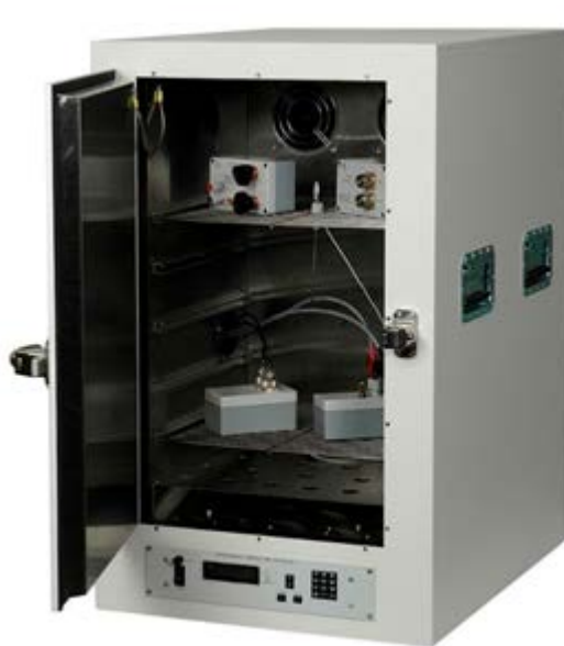
Figure 3-1 : 5032 Programmable Temperature Air Bath

If calibrating in Air, it is recommended that a Temperature Stabilized Air Bath be used. The Standard Calibration Laboratory Temperature of 23 °C is the recommended temperature. Note that there is a temperature coefficient that must be accounted for in the uncertainty contributions if using at a temperature that is different from the last calibration. The Guildline 5032 Temperature Air Bath (shown below) is recommended to provide a stable temperature environment for calibration or use. This Laboratory Grade Air Bath maintains the temperature environment around the resistance standard to \pm 0.03 °C of set point and also provides a desirable RF and EMI Shielded environment.