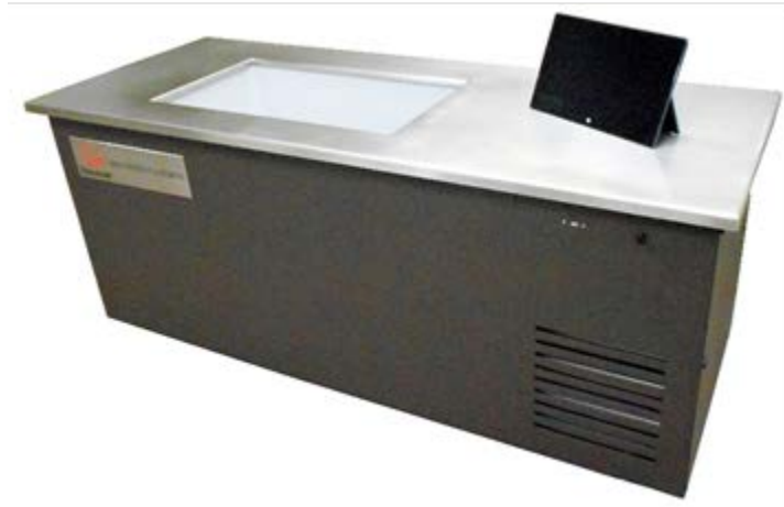
Figure 3-2 : 5600 Series Precision Fluid Bath

If calibrating in Oil, it is recommended that the bath be stable to 3 mK or less. The Guildline 5600 Precision Fluid Bath is the recommended bath. For Oil Baths, it is recommended that the oil temperature be between 23°C and 25°C for calibration. A 5600 Series Precision Fluid Bath is shown below.