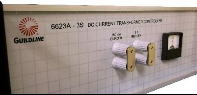
6623A-3S Front and Rear Views

The direct current transformer is designed with an open window to pass through a cable, set of cables, or buss bar that carry the current to be measured. The 6624CT-3000 DC Current Transformer produces an output current that varies directly with the input current in three ranges. By the connection of a reference shunt burden on one of the output terminals the current can also be calculated by measuring the voltage drop across the reference shunt. All necessary interconnections for the control of the 6623A-3S