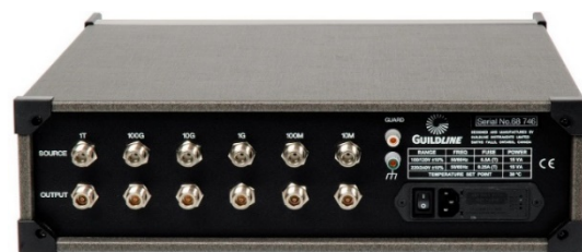
(Model 6636 Rear)

Guildline also provides world leading Air Resistance Standards with values from 100 \mu\Omega all the way to 100 G \Omega with our 9334A Series; and from 10 M \Omega to 10 P \Omega with the 9336 and 9337 Series.