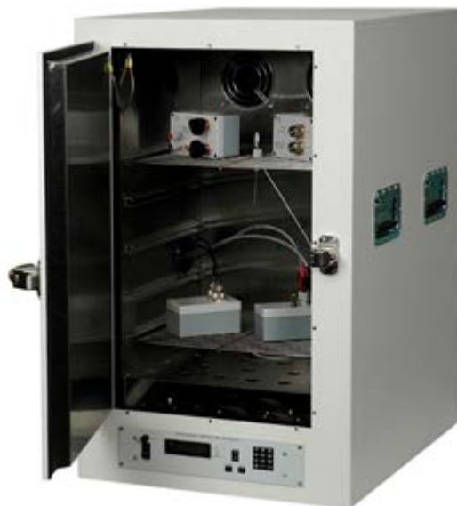
Figure 3-1 : 5032 Programmable Temperature Air Bath

If calibrating in Air, it is recommended that a Temperature Stabilized Air Bath be used. The Standard Calibration Laboratory Temperature of 23 °C is the recommended temperature. Note that there is a temperature coefficient that must be accounted for in the uncertainty contributions if using at a temperature that is different from the last calibration. The Guildline 5032 Temperature Air Bath (shown to the right) is recommended to provide a stable temperature environment for calibration or use. This Laboratory Grade Air Bath maintains the temperature environment around the resistance standard to \pm 0.03 °C of set point and also provides a desirable RF and EMI Shielded environment.