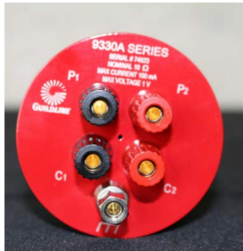
Figure 1-2 : 9330A Resistance Standard

Maintenance of the resistor consists only of routinely inspecting the unit for physical damage and cleanliness. They should be cleaned with isopropanol, and a soft brush or cloth. Special care should be taken to ensure the terminal connections and insulators are clean.