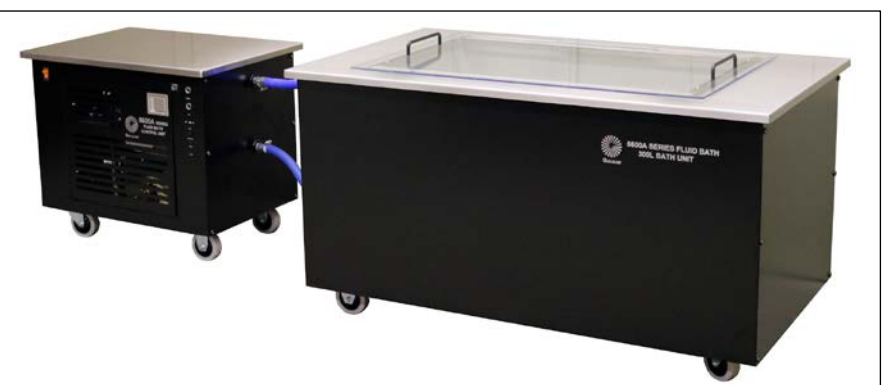
5600-300L Control/Mechanical Unit and Tank Unit

All Baths come with a removable EMI shielded gabled transparent tank cover allowing full access to the bath, and removable panels to allow easy access to the Bath interior. This entry access is shown to the left (closed) and shown to the right (door open).